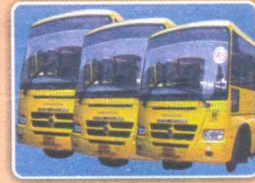
Transport Facility provided to Kothagudem & Manuguru