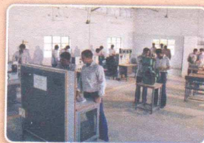
State of Art Laboratories

The LIBRARY is replete with more than 28,000 volumes of books, 100 National and International journals