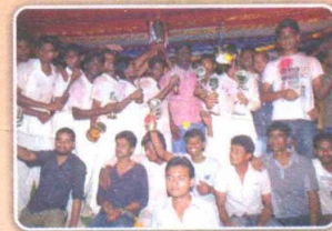
Dr. Paul Raj Engineering College Cricket Team with JNTUH Zone B Winners Trophy

Well qualified, experienced, motivated and committed faculty drawn from industry and academia to conduct the academic programs of the college.