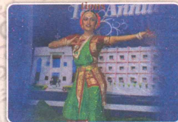
13th Annual Day Celebra-

The TRAINING AND PLACEMENT CELL of the Institute trains the students for enhancing their COMMUNICATION AND PRESENTATION SKILLS & LEADERSHIP QUALITIES, THROUGH MOCK INTERVIEWS AND GROUP DISCUSSIONS etc., for possible employment in reputed industries.