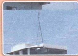
2Mbps Broad band internet facility