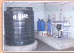
Purified Drinking water facility